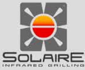
Table of Contents & Introduction