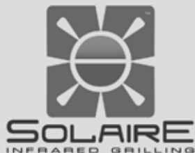
Table of Contents & Introduction