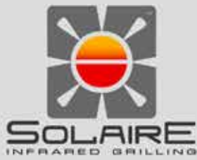
Table of Contents & Introduction